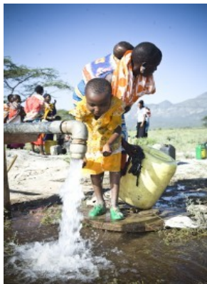
Maasai woman and child collect clean water at the well site.

Let us know if you would like to attend any of these trips!